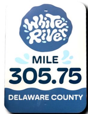
12x18 Retroreflective Mile Marker Signs

We would like to thank the Ball Brothers Foundation for funding the design and manufacture of the signs, the Delaware County Soil and Water Conservation District for coordinating the grant application, Intersection Design Agency for the design of the signs, and Canoe Country for their support and assistance.